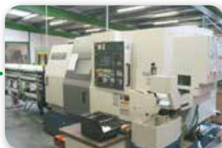
steel part production