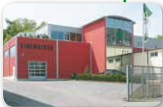
high-bay warehouse & administration