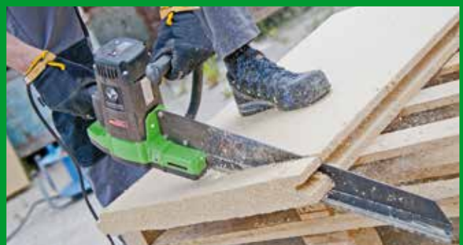
pressure-resistant insulation material