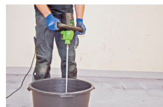
MXT 100-2 →