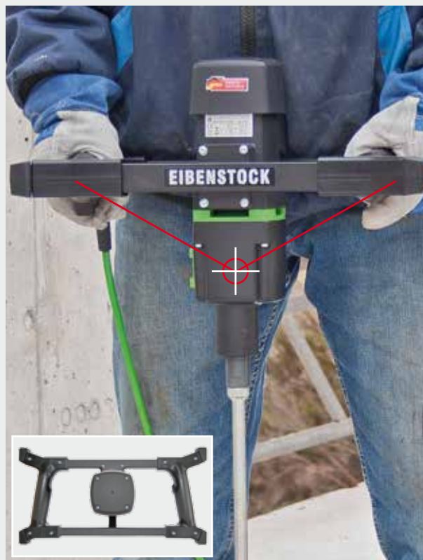
Wide, trapezium design, ergonomic handles and balanced center of gravity – easy, well balanced guiding of the machine for greater leverage